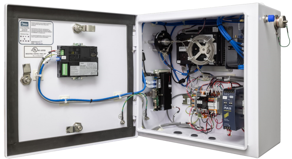
Verax SSG NIR Spectrometer