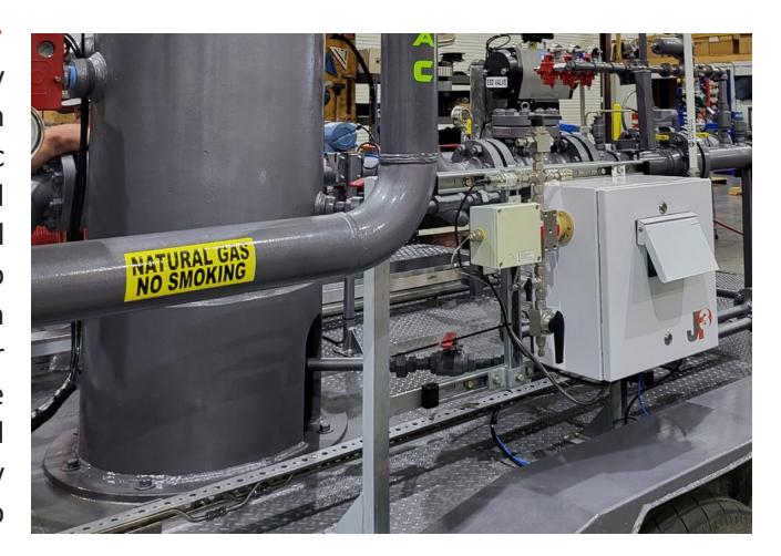
Verax SSG Mounted on a Trailer

The JP3 Verax system uses NIR (Near Infrared) spectroscopy technology to measure gases or liquids in real time with absolutely no moving parts or consumables. Using chemometric models, the Verax system measures gas BTU, composition, and multiple other properties simultaneously. Built with a rugged steel enclosure, trailer-mounted Verax systems are designed to withstand the conditions and vibration inherent in operating with a frac fleet. Each analyzer has a cellular modem, allowing for remote monitoring and control. As requirements change, the Verax can be remotely reconfigured with minimal cost and downtime. System set-up and tear-down is simple; the only required utility is electrical power, and there is no need to calibrate or hook up gases or standards at a new site.