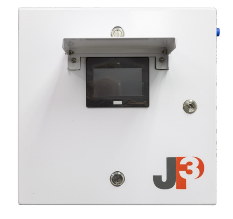
Verax SSG NIR Analyzer