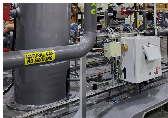
Verax SSG installed on a mobile trailer

JP3 Verax's advanced electronics and communication capabilities allow easy integration into your plant networks and systems. Verax also supports monitoring via secure cellular data connection, making even the most remote unmanned applications possible and economical.