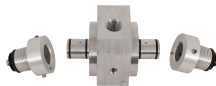
Verax NIR Flow Cell

The Verax flow cell is installed directly on the process at operating pressure and temperature; no sample conditioning system is required. The flow cell may either be directly connected to the analyzer (SSG-I) or tethered by a pair of fiber optic cable (SSG-T), allowing the analyzer to be located away from the process if needed. The Verax SSG supports multiple simultaneous compositional and physical property analyses. JP3's advanced technology means all Verax analyzers produce no emissions and require no carrier or calibration gases.