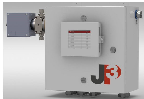
Verax SSG NIR Spectrometer

The Verax™ SSG single-stream gas analyzer is built upon the same field-proven technology as the Verax CTX. The SSG provides rapid and reliable measurement of key compositional and physical properties for a wide variety of gas-phase analytical applications. The SSG system is highly reliable, requires neither consumable materials nor sample conditioning, and delivers real-time process measurements with extremely high accuracy. The Verax SSG meets or exceeds applicable GPA and ASTM performance requirements for repeatability and reproducibility. Older, less reliable and maintenance intensive technologies can now be replaced with confidence. The unit can be powered by a small solar panel, or standard 120V AC or 24V DC.