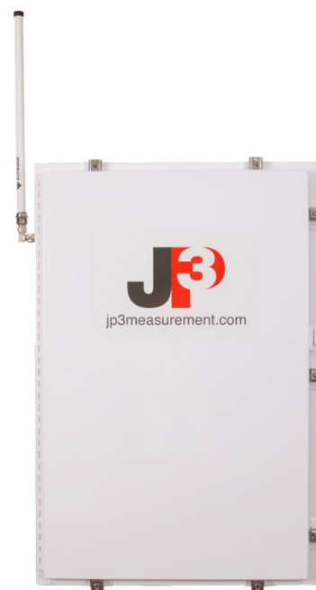
Verax NIR Analyzer