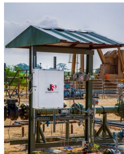
Verax CTX Installation

JP3 Verax's advanced electronics and communication capabilities allow easy integration into your plant networks and systems. Verax also supports monitoring via secure cellular data connection, making even the most remote unmanned applications possible and economical.